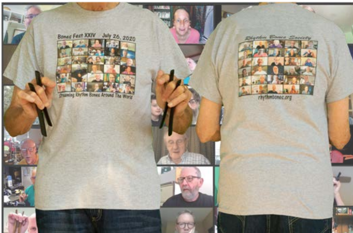
The Bones Fest XXIV T-shirt.